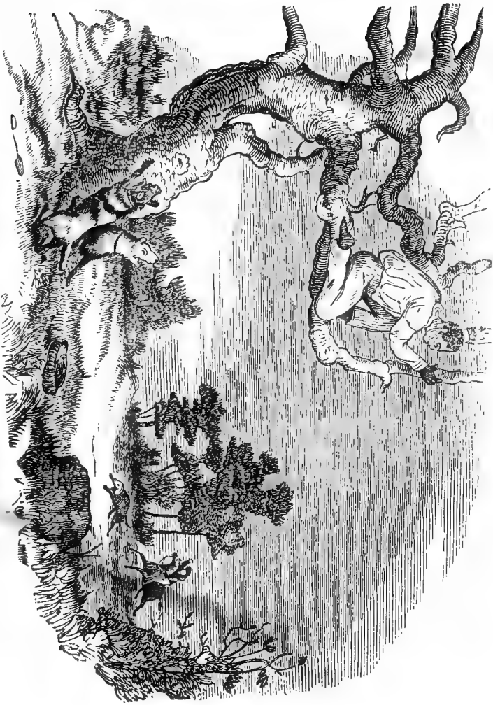
The author caught by the bloodhounds. (See p. 21.)